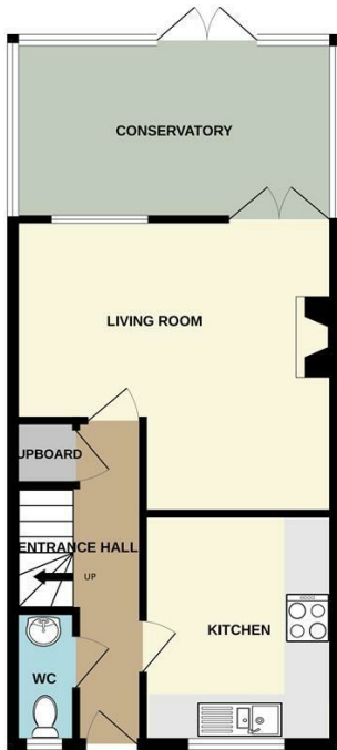
GROUND FLOOR 543 sq.ft. (50.4 sq.m.) approx.